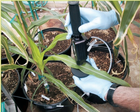
Steve Kelley, NREL/PIX 12775

Rapid analysis methods specific to biomass are needed for the emerging biomass conversion industry.