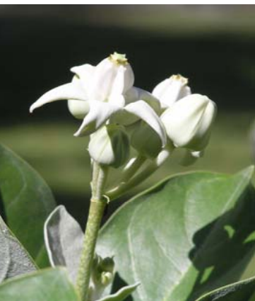
*Crown flower (Calotronis gigantea

Top Ten Inquiries About Plants Received by the Hawaii Poison Hotline