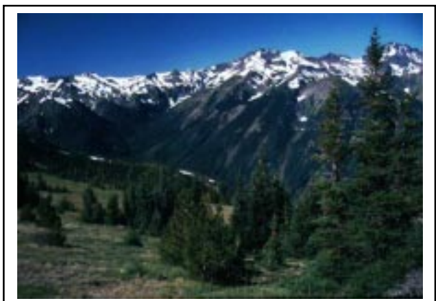
Alpine meadows in the Upper Dungeness drainage.

PASS REQUIRED: A NW Forest Pass or a Golden Passport (Eagle, Age or Access) is required on each vehicle parked at trailhead. Day & Annual NW Passes are available at FS offices and vendors, but not at trailheads.