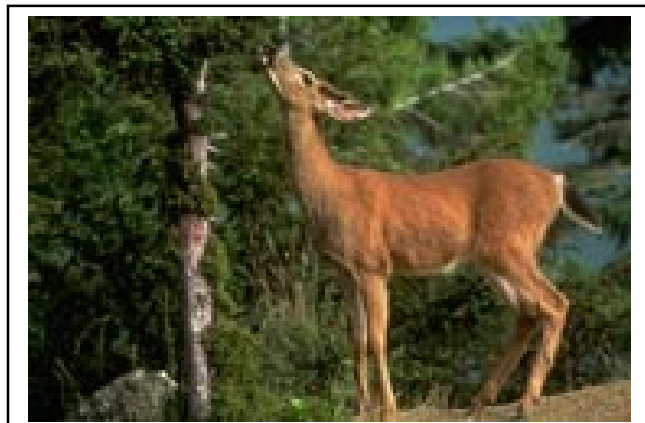
A Columbian black-tail doe nibbles on tender leaves.

TRAIL INFORMATION: 7.9 miles in length, grade 20%, some areas lower and some steeper especially on the Dosewallips side of the ridge.