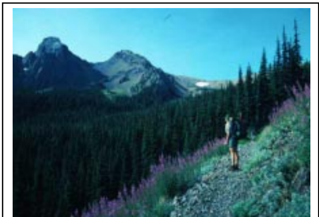
Hiker stops to enjoy the view below Buckhorn Pass.

TOPO MAPS: Buckhorn Wilderness Custom Correct Map or Tyler Peak USGS Quad.