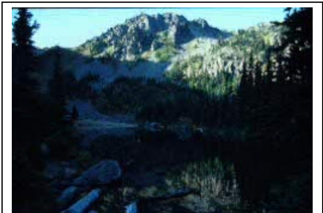
Early morning sun over Silver Lake.

TRAIL INFORMATION: 5.5 miles in length from upper Mt. Townsend Trailhead. Grade is 20% to Silver Lakes Trail for 3 miles and 8% the last 2.5 miles.