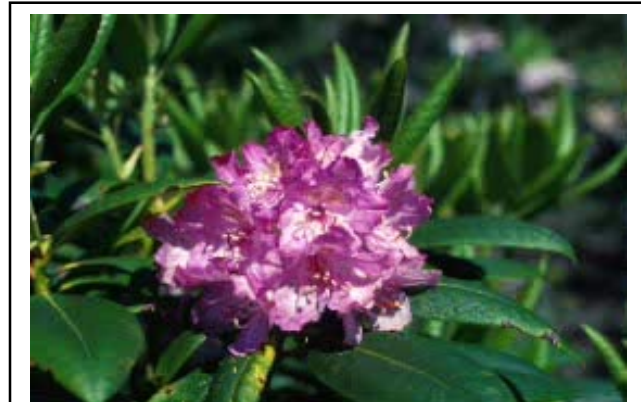
Pacific rhododendron, Washington's State Flower.

SETTING: Dense forest-hike along Royal Creek. Meadows, wildflowers, waterfalls and a mountain-lake in Royal Basin.