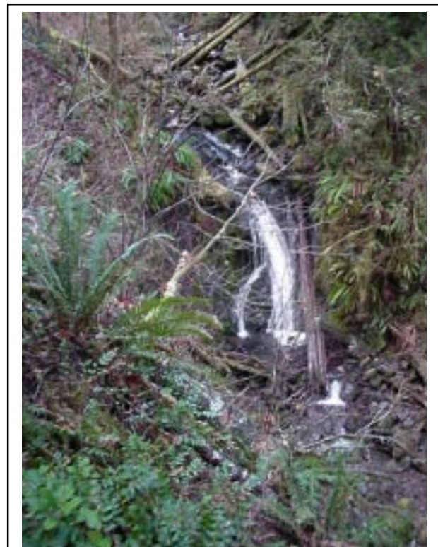
A small waterfall can be viewed from the Rainbow Trail #892.