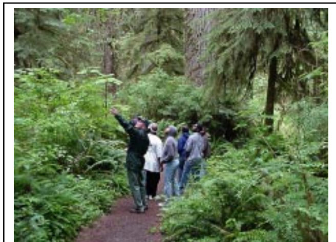
Visitors enjoy views of towering conifers and lush rain forest vegetation along the Quinault Rain Forest Nature Trail #855.

TRAIL INFORMATION: The trail is a short 1/2 mile loop nature trail with colored signs interpreting the Olympic’s temperate rain forest.