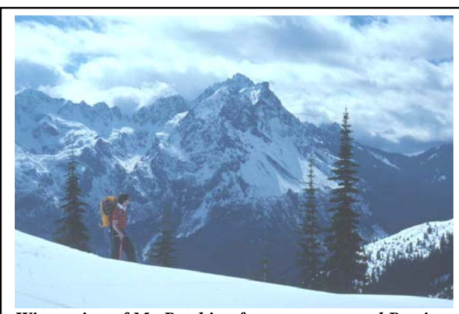
Winter view of Mt. Pershing from snow covered Putvin Trail #813.

PASS NOT REQUIRED: A NW Forest Pass or a Golden Passport (Eagle, Age or Access) is not required on vehicles parked at this trailhead.