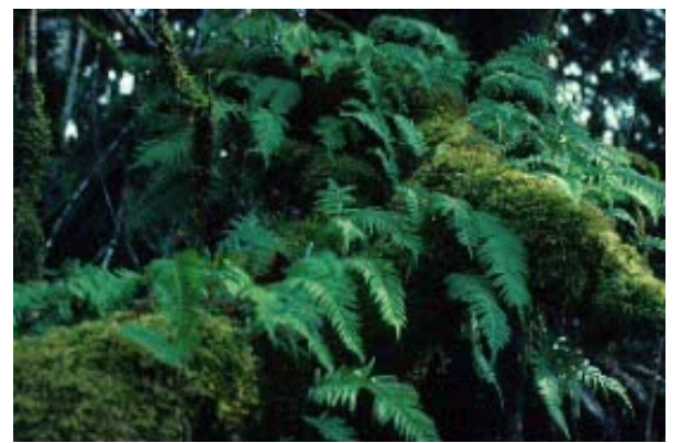
Lush rain forest vegetation can be seen along Pete's Creek Trail #858.

TOPO MAP: Quinault-Colonel Bob Custom Correct Map or Quinault Lake USGS Quad.