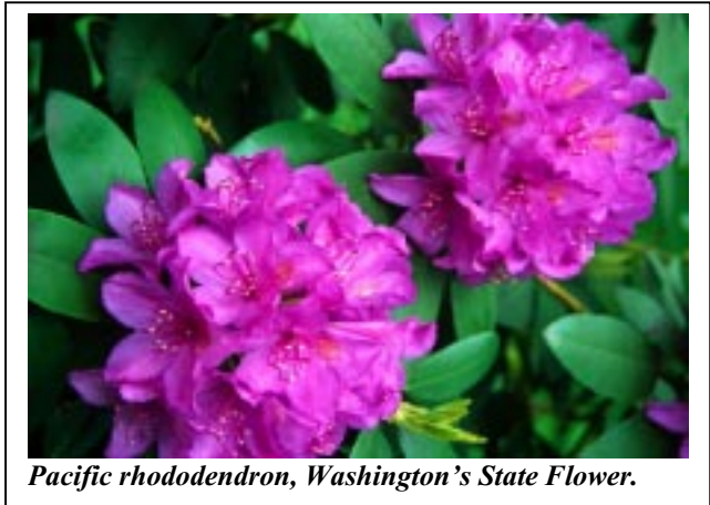
Pacific rhododendron, Washington's State Flower.