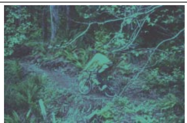
Many different types of users including mountain bike riders enjoy the South Fork Skokomish Trail #873.

PASS REQUIRED: A Northwest Forest Pass is required on all vehicles parked at the trailhead. $5 Day Pass or $30 Annual Pass are available at FS offices and vendors. Passes are not available at trailheads.