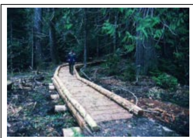
Trail puncheon along the upper section of the Lower Dungeness Trail #833.

PASS REQUIRED: A NW Forest Pass or a Golden Passport (Eagle, Age or Access) is required on each vehicle parked at trailhead. Day and Annual NW Passes are available at FS offices and vendors, but not at trailheads.