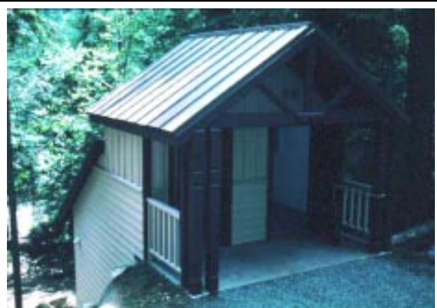
Composting toilet at Lena Lake.

PASS REQUIRED: A NW Forest Pass or a Golden Passport (Eagle, Age or Access) is required on each vehicle parked at trailhead. Day & Annual NW Passes are available at FS offices and vendors, but not at trailheads.