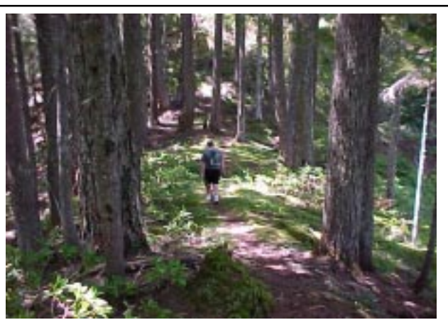
A day hiker enjoys a walk through a high elevation forest along the Jefferson Pass Trail #800.

PASS NOT REQUIRED : A Northwest Forest Pass is NOT REQUIRED at this trailhead.