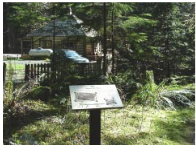
Interpretive signs with historic photographs take the visitor back in time to the early 1900's.

PASS REQUIRED: A NW Forest Pass or a Golden Passport (Eagle, Age or Access) is required on each vehicle parked at trailhead. Day & Annual NW Passes are available at FS offices and vendors, but not at trailheads.