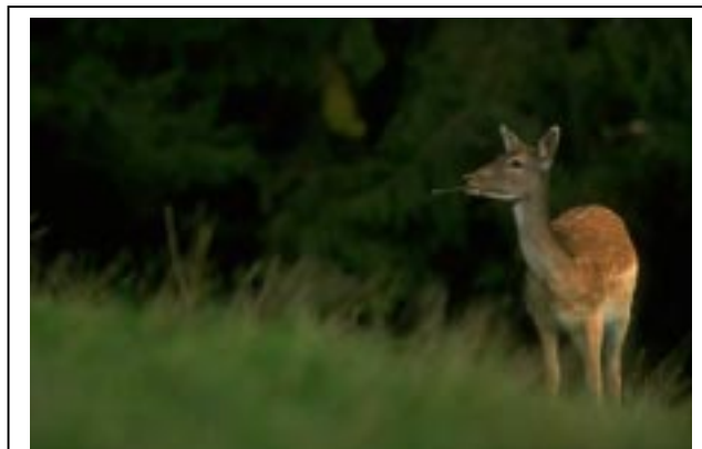
Columbian black-tail deer are often seen from the Deer Ridge Trail #846.

TRAIL INFORMATION: 5.2 miles in length, grade is moderate to steep, 35% maximum. Trail enters Park at 3.6 miles. Overnight camping in Park backcountry requires Wilderness permit.