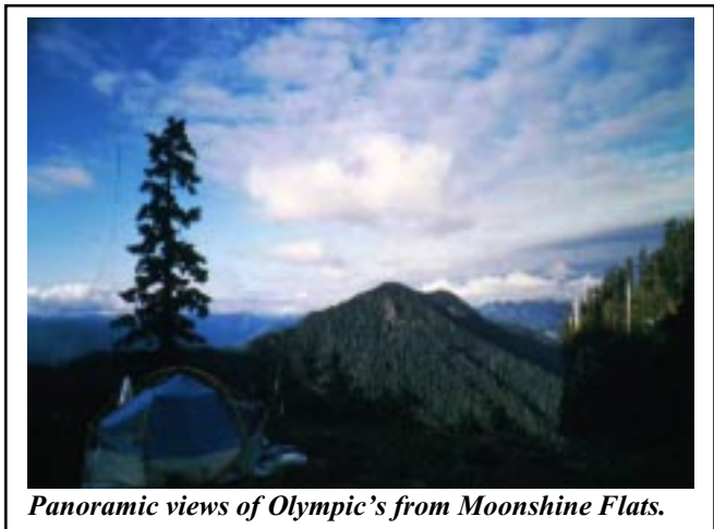
Panoramic views of Olympic’s from Moonshine Flats.

TOPO MAP: Quinault-Colonel Bob Custom Correct Map or Quinault Lake USGS Quad.