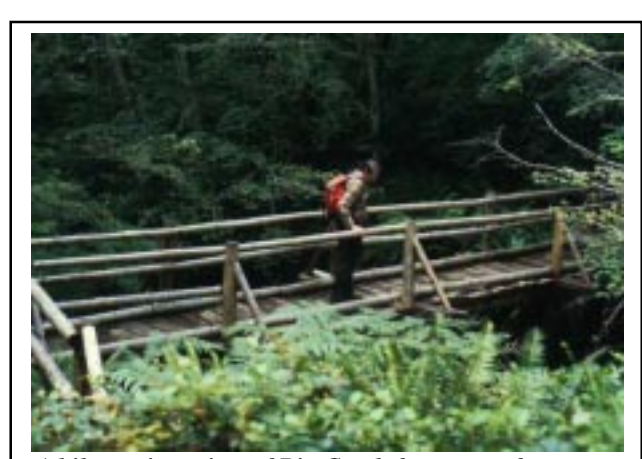
A hiker enjoys view of Big Creek from one of two trail bridges along the trail.

PASS REQUIRED: A NW Forest Pass or a Golden Passport (Eagle, Age or Access) is required on each vehicle parked at trailhead. Day & Annual NW Passes are available at FS offices and vendors, but not at trailheads.