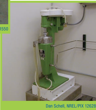
Dan Schell, NREL/PIX 12628