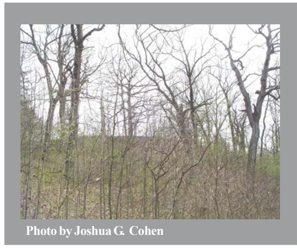
Suppression of fire in oak openings leads to woody species encroachment and eventually canopy closure.

concentrated during appropriate stages in plant growth cycles (i.e., when root metabolite levels are lowest late in the growing season or during the winter) (Reinartz 1997, Solecki 1997). The process of restoring the open canopy conditions and eliminating the understory should be conducted gradually, undertaken over the course of several years. As noted by Botts et al. (1994), too rapid a reduction in canopy can lead to severe encroachment of weedy species. The incremental opening of the canopy, especially when followed by the implementation of prescribed fires, can result in the germination of savanna species dormant in seedbanks during fire suppression.