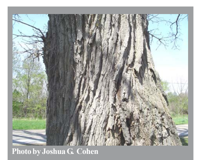
Bur oak (pictured) and white oak are extremely fireresistant. Both have thick, corky, insulating bark, deep roots, and the capacity to resprout after fire.

layer (Stout 1946, Cottam 1949, Peters 1970, Chapman 1984). The broad-crowned, scattered oaks were typically of the same age cohort typically 10 to 60 feet apart, with diameter at breast height ranging widely between 10 and 80 inches (Lanman 1871). The canopy layer generally varied from 10 to 60% cover (NatureServe 2004) and was dominated by Quercus alba (white oak) with co-dominants including Quercus macrocarpa (bur oak), and Quercus muehlenbergii (chinkapin oak) (Lanman 1871, Beal 1904, Cottam 1949, Chapman 1984, NatureServe 2004). As noted earlier, white oak and bur oak with their thick bark, deep roots, and resprouting abilities are the most fire resistant of the oaks. In addition, expansive root systems that can extend down several meters and branch extensively laterally allow these oaks to withstand extreme drought stress (Albertson and Weaver 1945, Abrams 1992, Faber-Langendoen and Tester 1993). Both species of oak are long-lived, often remaining as canopy dominants for 200-300 years (Cottam 1949).