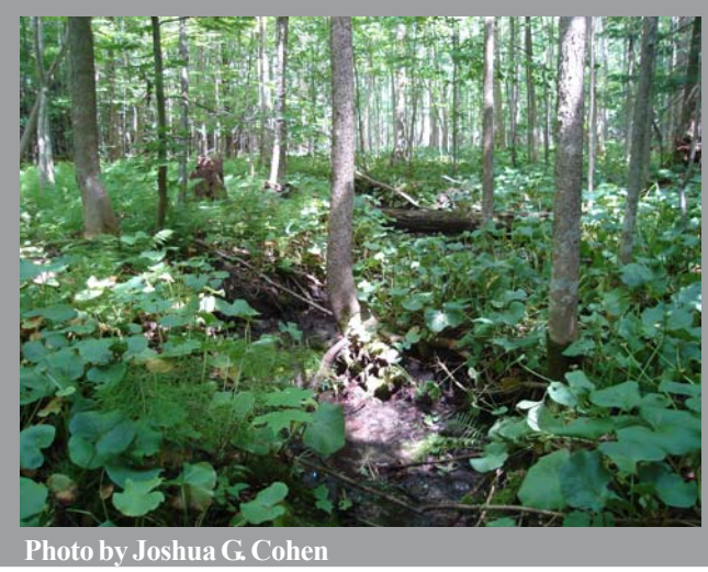
Intermittent stream bed meandering through a northern hardwood swamp with mucky soils.