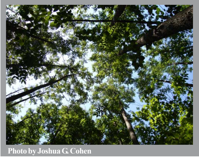
Filtered light through the open black ash canopy allows for a dense and diverse ground cover layer to develop following the recession of seasonal flooding.

that is patchy both seasonally and spatially depending on timing, location, and duration of flooding. Sites are often saturated to inundated in spring and following heavy rains, resulting in numerous sparsely vegetated to bare areas in the understory and ground layers. During the late growing season, when seasonal waters draw down, the herbaceous layer is typically dense.