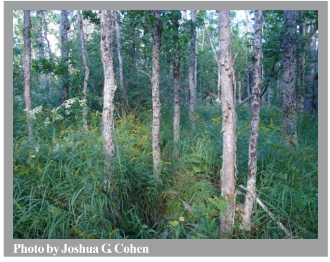
Common herbaceous plants include northern bugleweed (Lycopus uniflorus), mad-dog skullcap (Scutellaria lateriflora), common skullcap (S. lateriflora), wood anemone (Anemone quinquefolia), jack-in-the-pulpit (Arisaema triphyllum), false nettle (Boehmeria cylindrica), marsh marigold (Caltha palustris), Pennsylvania bittercress (Cardamine pensylvanica), fringed sedge (Carex crinita), bladder sedge (C. intumescens), hairy sedge (C. lacustris), alpine enchanter nightshade (Circaea alpina), goldthread