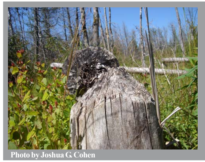
Beaver can influence northern hardwood swamps by generating canopy gaps and by altering the hydrology.

A common agent in hydrologic change in swamp systems is beaver. Through dam-building activities, beaver can instigate substantial hydrologic change; either causing prolonged flooding or lowering of the water table depending on the location of the forest in relation to the dam (Gates 1942, Curtis 1959, Heinselman 1963, Jeglum 1975, Futyma and Miller 1986). Behind a beaver dam the water table is higher while below it, drier conditions are generated (Jeglum 1975). In addition to altering hydrology, beaver can generate canopy gaps within these systems by cutting down trees that range in stump diameter from 25 to 51 cm (10 to 20 in) (Wright and Rauscher 1990).