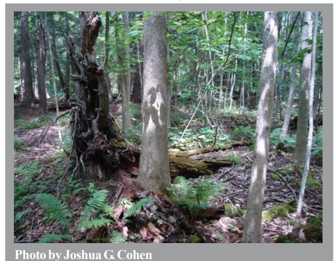
Small windthrow events, which are prevalent due to the shallow rooting of canopy trees, generate microtopography that increases floristic diversity.

Catastrophic disturbances other than flooding were most likely infrequent. Large scale windthrow and fire in northern hardwood swamps of Minnesota had a rotation of 370 and 1,000 years, respectively (MNDNR 2003). However, small windthrow events are common in these systems due to shallow rooting within muck soils. The uprooting of trees creates pit and mound microtopography that results in fine-scale gradients of soil moisture and soil chemistry.