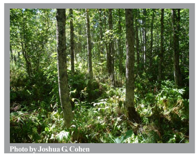
Northern hardwood swamps are characterized by overstory dominance by black ash, patches of shrubs, such as alder and winterberry, and a diverse ground cover, with ferns and graminoids well represented.

Vegetation Description: Black ash ( Fraxinus nigra ) is the overwhelming canopy dominant of northern hardwood swamp communities (Curtis 1959). Studies have reported black ash to be both a short-lived species, with a lifespan of around 75 years (Parker and Schneider 1974, Lees and West 1988, Sims et al. 1990), and a relatively long-lived species with trees frequently over 200 years old (Tardif and Bergeron 1999). Average diameter at breast height (DBH) of trees that are 110 to 130 years old ranged from 25 to 30 cm (10 to 12 in) (Tardif and Bergeron 1999). A sample of tree DBHs recorded by GLO surveyors in lowland hardwood swamps of Mason County in the early 1800s ranged from 15 to 66 cm (6 to 26 in) and averaged approximately 32 cm (13 in). Preliminary surveys of current northern hardwood swamp indicate that diameters typically range from 10 to 30 cm (4 to 12 in).