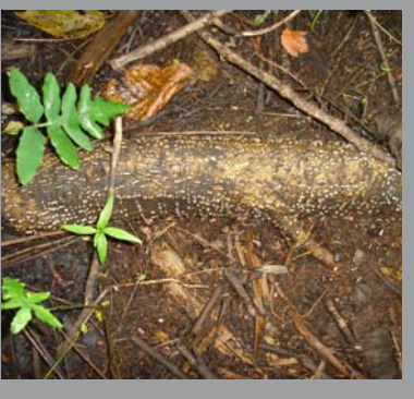
Enlarged lenticels on the bole and roots of black ash are an adaptation to soil saturation.

Natural Processes: Seasonal flooding is the primary disturbance in northern hardwood swamps. Standing water, usually a result of groundwater seepages, can reach over a foot in depth, and is usually present in the spring and drained by late summer. Water often pools due to an impermeable clay layer in the soil. Overstory species associated with flooding have several adaptations to soil saturation such as hypertrophied