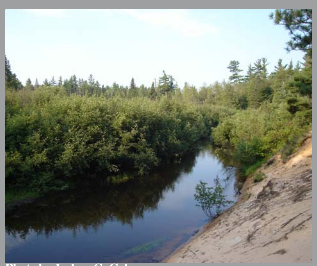
Northern shrub thicket is prevalent along the Two Hearted River in Luce County, Upper Michigan.