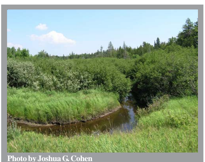
Occurring frequently along streams, northern shrub thickets are characterized by saturated and nutrientrich organic or mineral soils.