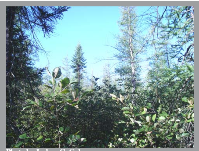
In the absence of disturbance, northern shrub thickets are often invaded by conifers such as tamarack.

(meadowsweet). Where alder does not form a monospecific shrub layer, associates of the tall shrub layer can include Aronia prunifolia (black chokeberry), Betula pumila (bog birch), Cornus amomum (silky dogwood), C. stolonifera (red-osier dogwood), Ilex verticilata (winterberry), Salix bebbiana (Bebb's willow), S. discolor (pussy willow), S. exigua (sandbar willow), S. petiolaris (slender willow), Viburnum cassinoides (wild-raisin), and V. opulus var. americanum (highbush-cranberry). Scattered trees and tree saplings are often found invading northern shrub thickets. Typical tree species include balsam fir, red maple, black ash, tamarack, black spruce, balsam poplar, quaking aspen, and northern white-cedar. (Above species lists compiled from Michigan Natural Features Inventory database, Curtis 1959, White 1965, Parker and Schneider 1974, Hoffman 1989, Van Deelen 1991, Eggers and Reed 1997, Faber-Langendoen 2001, Hoffman 2002, NatureServe 2006.)