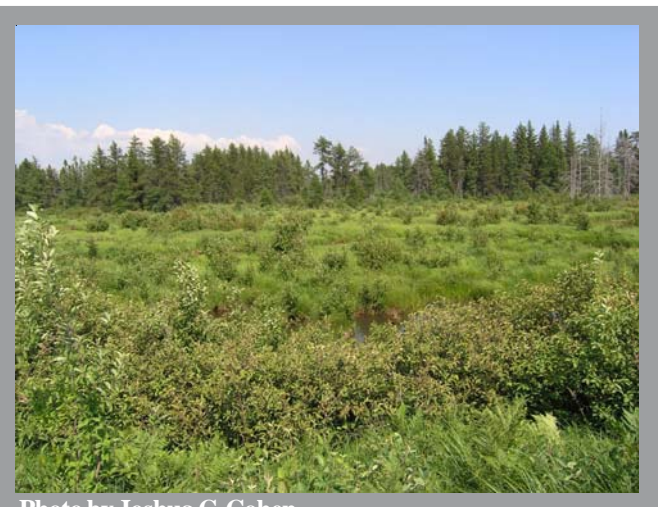
Lowering of the water table, an absence of beaver flooding, or fire suppression can result in the conversion of northern wet meadow to northern shrub thicket.

through establishment of seedlings or stump sprouting. Following canopy release, alder can form dense, impenetrable thickets that retard or prevent tree establishment (Huenneke 1983, 1987). Within open wetlands, alder and associated shrubs can become established following alteration in the fire or hydrologic regime. Prolonged periods without fire, an absence of beaver flooding, or the lowering of the water table allows for shrub encroachment into open wetlands and conversion to northern shrub thicket (Curtis 1959, White 1965, Jean and Bouchard 1991, Eggers and Reed 1997, Hoffman 2002).