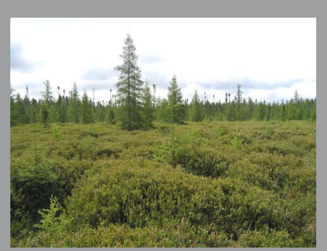
Ericaceous shrubs such as leatherleaf can limit the establish ment and growth of conifers within muskegs through competition.

development of black spruce and are also believed to negatively impact the ecotomycorrhizal fungi associated with black spruce (Peterson 1965, Thompson and Mallik 1989, Zhu and Mallik 1994, Yamasaki et al. 1998). The negative effects of sheep-laurel on black spruce root growth are most pronounced under acidic condition (Zhu and Mallik 1994).