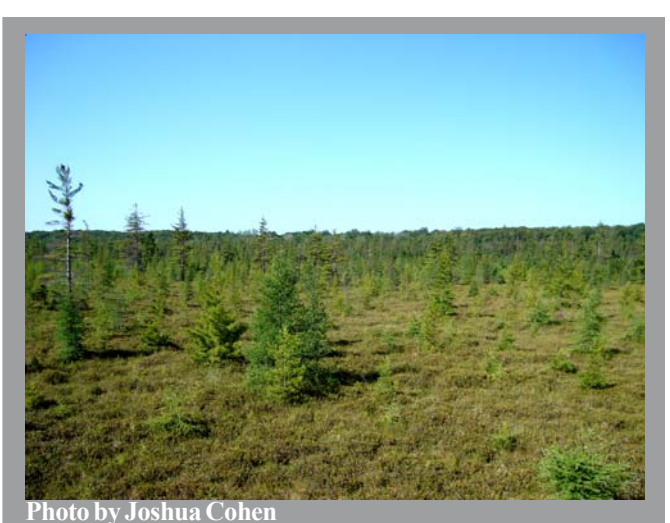
Muskegs occur most frequently on broad, flat, expanses of paludified glacial lakeplain (above) and outwash.

Physiographic Context: Two landscape features are conducive to the development of peat; small ice-block basins and poorly-drained, level terrain (Boelter and Verry 1977). Muskegs primarily occur on broad, flat areas or mild depressions of glacial outwash and glacial lakeplains but can also be found in large depressions on pitted outwash and moraines (Gates 1942, Curtis 1959, Crow 1969, Henry et al. 1973, Boelter and Verry 1977, Foster 1985, Bubier 1991, NatureServe 2006, Kost et al. 2007). Peatlands occurring on former glacial lake beds and drainageways tend to be more extensive than kettle peatlands, which are limited in area by the size of the glacial ice-block which formed the basin (Lindeman 1941). Peatlands range in size from a few thousand square meters to several thousand hectares (Futyma and Miller 1986). The overall topography of muskegs is flat to gently undulating with microtopography characterized by hummocks and hollows (Heinselman 1963, Vitt and Slack 1975, Wheeler et al. 1983, Glaser et al. 1990, Bubier 1991, Locky et al. 2005, NatureServe 2006). The pronounced microtopography in these systems leads to extreme and fine-scale gradients in soil moisture and pH (Bridgham et al. 1996).