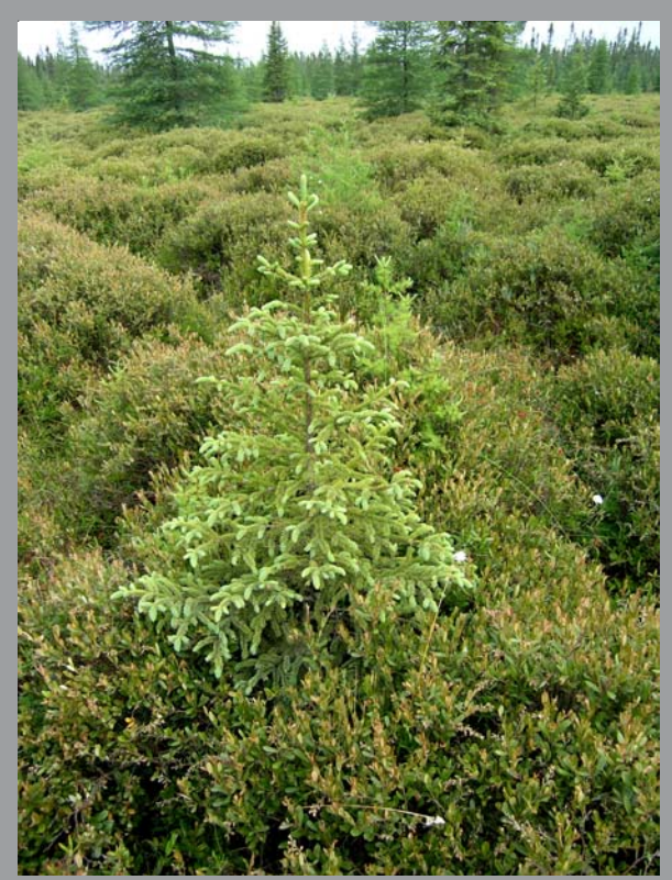
Scattered and stunted conifers establish on hummocks