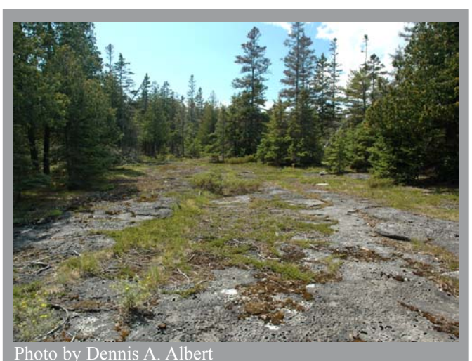
Alvar grassland grades to limestone bedrock glade on Drummond Island.

Albert, D.A. 2007. Natural community abstract for limestone bedrock glade. Michigan Natural Features Inventory, Lansing, MI. 7 pp.