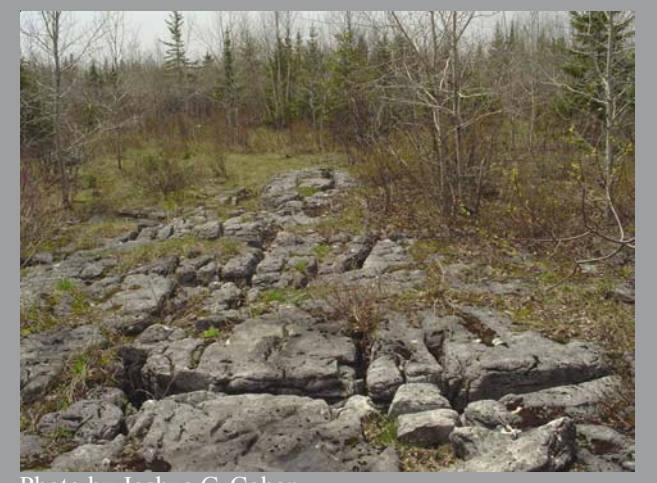
Carbonic and organic acids from decomposing vegetation and plant respiration accelerate the rate of dissolution in the structural joints of the limestone bedrock, creating broad cracks called grykes. These cracks in the limestone allow for soil accumulation and the establishment of trees and shrubs.

make up 36% of the flora, followed by 20% shrubs and 17% trees. Six percent of the flora is perennial grasses, 5% perennial sedges, and 3% ferns. Dominant trees include northern white cedar (Thuja occidentalis), white spruce (Picea glauca), paper birch (Betula papyrifera), and balsam fir (Abies balsamea). Tree height is typically less than 20 feet (6 m). Common shrubs include soapberry (Shepherdia canadensis) and bearberry (Arctostaphylos uva-ursi). Common herbs are Canada mayflower (Maianthemum canadense), wild strawberry (Fragaria virginiana), balsam ragwort (Senecio pauperculus), and large-leaved aster (Aster macrophyllus). Poverty grass (Danthonia spicata), slender wheat grass (Agropyron trachycaulum), and bracken fern (Pteridium aqualinum) are also common. Common non-native herbs are ox-eye daisy (Chrysanthemum leucanthemum) and lawn prunella (Prunella vulgaris).