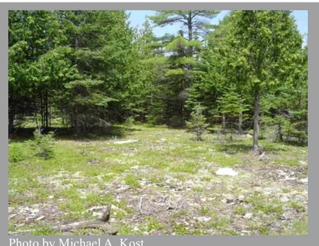
Limestone glade occurs on thin neutral to alkaline soils overlying limestone bedrock. Shallow soils result in seasonal flooding in flat portions of glade from fall to spring and in drought stress during summer months.

storm events during earlier post-glacial times, when present-day inland sites were inundated by higher Great Lakes lake levels. Limestone glades of northern whitecedar ( Thuja occidentalis ), white spruce ( Picea glauca ), balsam fir ( Abies balsamea ), and paper birch ( Betula papyrifera ) occur where there is deeper soil development or better drainage than on nearby alvar. Both thin soils and poor drainage result in greater dominance of herbaceous vegetation.