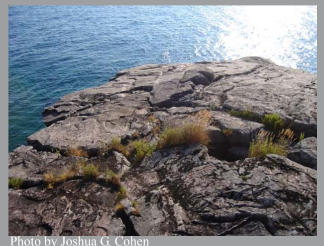
The 'wave-washed zone' immediately adjacent to the lake is devoid of vegetation due to wave action and ice scour while the 'open, vegetated zone' is dominated by lichens and mosses with herbs and occassional shrubs restricted to bedrock cracks and depressions.

Zonation: Wave action and ice scour close to the lakeshore produce a 'wave-washed zone' that is almost devoid of vegetation except for small tufts of mosses and crustose lichens (Albert et al. 1997). Farther above the lake lies an 'open, vegetated zone,' where the dominant vegetation consists of mosses and lichens, with lichen cover increasing with elevation above the water. Herbs and shrubs are restricted to bedrock cracks in the lower part of this zone, but become more common with increasing elevation above the lake. Above the strong influence of storm waves and ice scour, woody vegetation gradually forms a 'shrub zone' where shrubs and shrub-sized and scattered overstory trees are also able to survive.