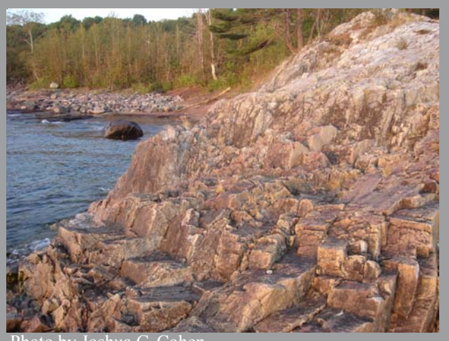
Granite bedrock lakeshore occurs on a variety of igneous and metamorphic bedrock including quartzite.

Research Needs: Additional characterization of nonvascular plants and resident fauna is needed. Documenting response of the community to fire will also help inform management efforts. Refinement of the classification of granite bedrock lakeshore demands the survey of sites in nearby Ontario (see below).