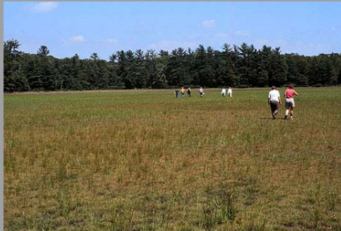
Low water level, Goose Lake, 1999