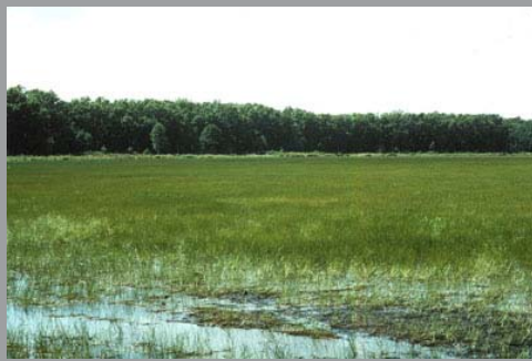
High water level, Goose Lake, 1990