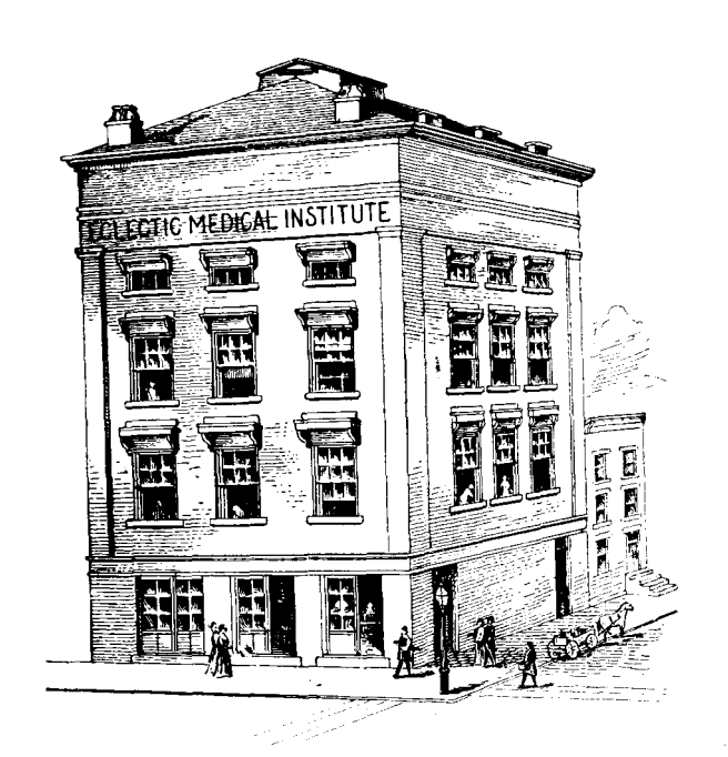
ECLECTIC MEDICAL INSTITUTE, 1846.