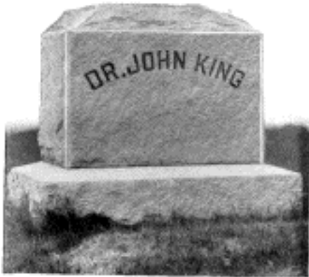
THE KING MONUMENT.

plaster, which apply on linen to the ulcer, cleansing it daily. Internally, use the following: Take of salt of tartar, one ounce; cream of tartar, four ounces; water, two quarts; mix and dissolve the salts: the dose is a wineglassful, three times a day. This solution alone is said to have removed a scirrhus tumor in six weeks.