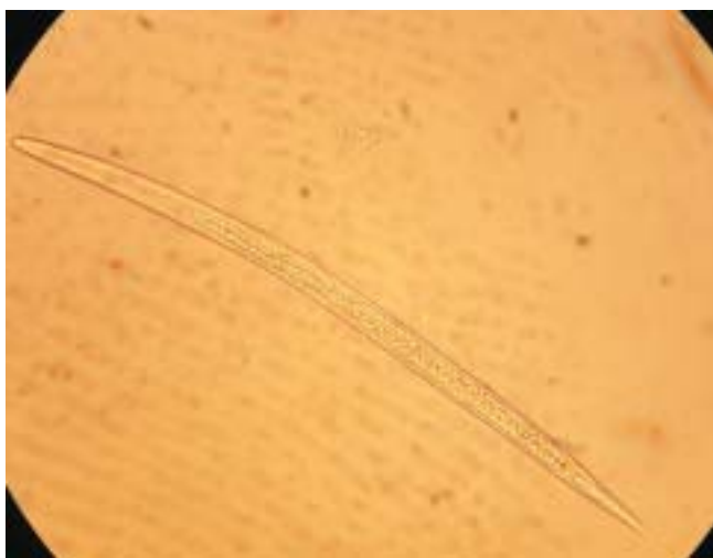
1. Juvenile root-knot nematode, 0.3 mm long, shown 300 times actual size.

Nematodes, also known as roundworms, are one of the most common phyla of animals and can be free-living or parasites of plants and animals. Root-knot nematodes are a group of nematodes that exclusively attack plant roots (Photo 1). Many important crops are susceptible to damage from these nematodes. After infecting the roots, their feeding causes development of knot-like structures known as galls (Photo 2). Several root-knot nematode females may be found within each gall. As parasites, nematodes take energy and nutrients away from the plant to support their own survival. Root-knot nematodes can severely damage crops by reducing their yield and quality. Severe infestations can lead to the death of a large number of plants and financial hardship for farmers.