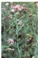
SPOTTED KNAPWEED Centaurea maculosa

Increases soil erosion and produces up to 1,000 seeds per plant.