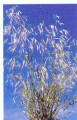
DOWNY BROME, or CHEATGRASS Bromus tectorum

Produces fine-textured plant fuel that promotes more frequent and larger wildfires.