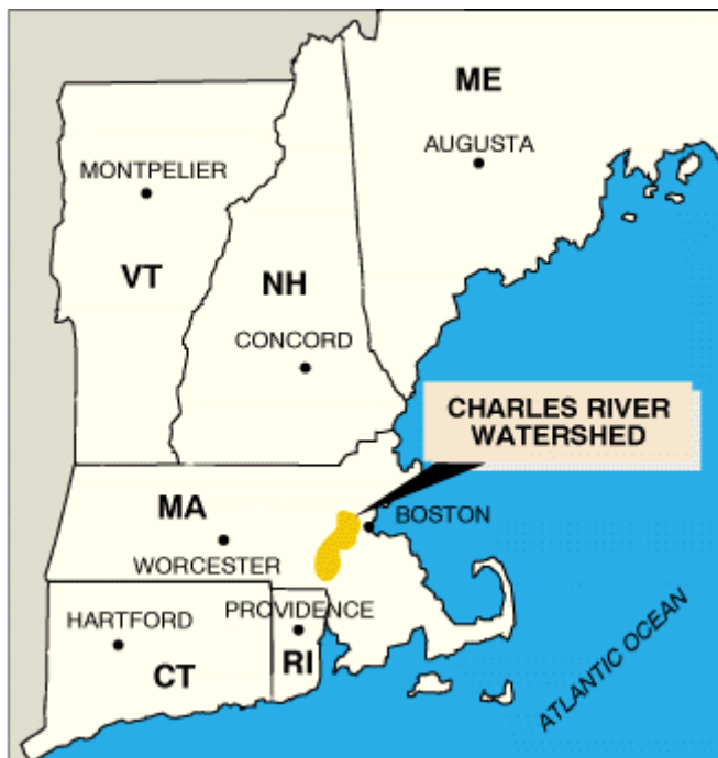
Location of the Charles River Project, Source: U.S. Army Corps of Engineers