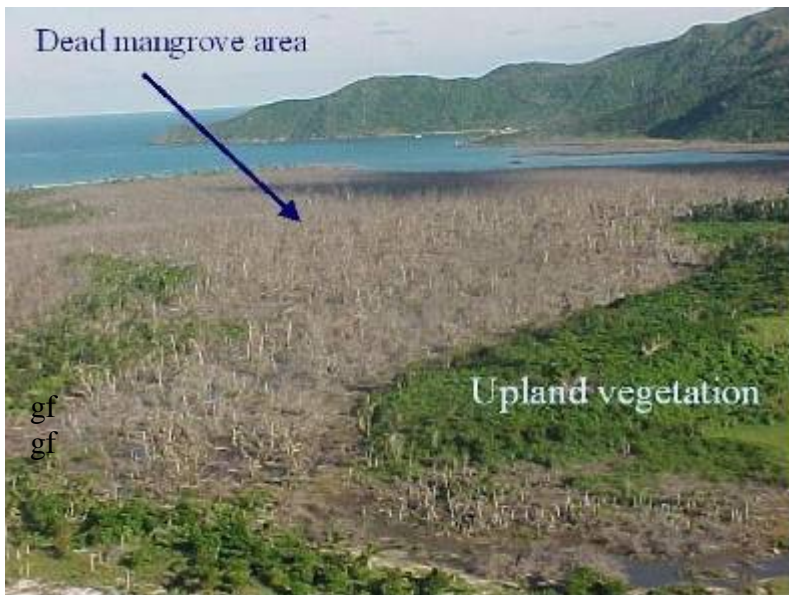
Mangroves damaged by Hurricane Mitch.