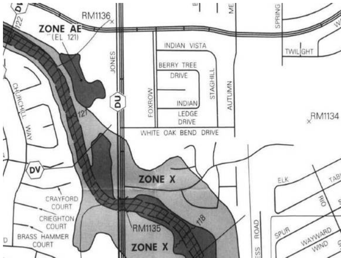
FEMA Flood Map.

The flood conveyance role of wetlands may appear contradictory with the flood storage role, but it is not. Flood storage areas are needed in headwater and broad near channel areas of a floodplain to reduce downstream flood heights. But, flood conveyance areas are also needed along narrow portions of a valley or in developed areas. Here even small increases in flood heights may overtop levees or increase flood damages to residential, commercial, or other areas. The flood conveyance versus storage roles of wetlands depend upon the location of the wetland in relationship to a river or stream, its depth, width and length, and its vegetation. They are both important.