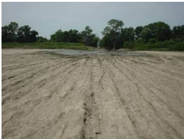
Sediment deposited at a levee breach by the Great Flood of 1993 along the Missouri river.

Wetlands in Southern Florida and Louisiana in National Water Summary on Water Resources, United States Geological Survey Water Supply paper 2425; van de Plassche et al. ( 2006 ). Salt-marsh erosion associated with hurricane landfall in southern New England in Geology . 2006; 34: 829-832; D. Cahoon et. al., 2002. Hurricane Mitch, Impacts on Mangrove Sediment Dynamics and Long-Term Mangrove Sustainability. U.S.G.S. (Open Filed Report) 03-184 at http://www.nwrc.usgs.gov/hurricane/mitch/Cahoon%20Mangrove%20Sediment%20Final%20Revised.pdf