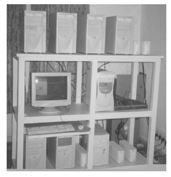
Figure 2: A Clustered Computer System in a Tier 3 Country