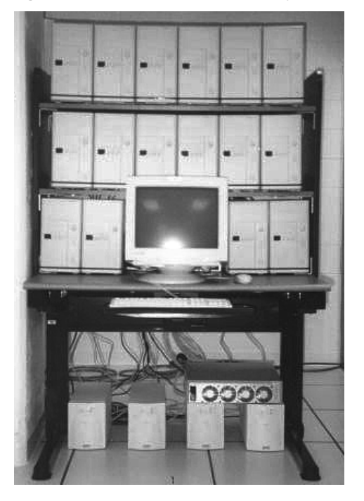
Figure 1: A Clustered Computer System