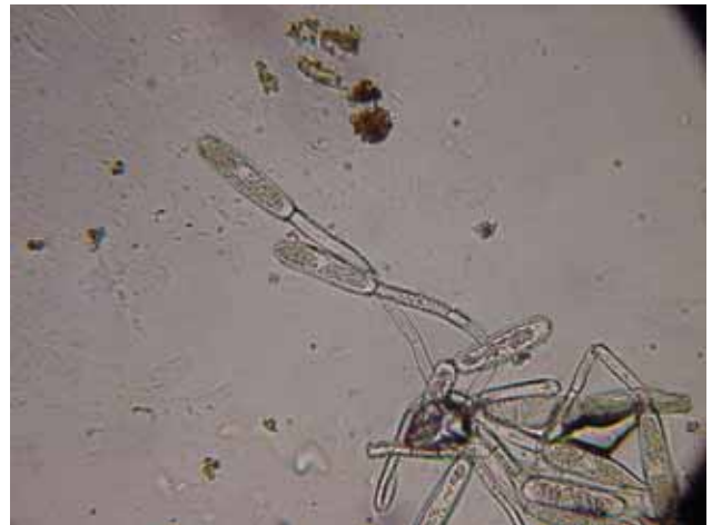
Figure 4. Powdery mildew, Leveillula taurica , grows through the stomates and produces white colonies of abundant spores (conidia) borne singly on stalks (conidiophores) on the underside of pepper leaves.

The powdery mildew disease cycle (life cycle) starts when spores (known as conidia) land on a pepper leaf (Figure 3). Spores germinate much like a seed and begin to grow into the leaf. Pepper powdery mildew parasitizes the plant using it as a food source. The fungus initially grows unseen within the leaf for a latency period of 18-21 days. Then the fungus grows out of the breathing pores (stomates) on the under surface of the leaf, producing spores which are borne singly on numerous, fine strands or stalks (conidiophores) (Figure 4). These fungal strands become visible as white patches or mildew colonies on the under side of the leaf. Air currents within the greenhouse carry these microscopic, infectious spores to more plants. Spores are dispersed further through the greenhouse vents. In addition to dispersal by air currents or wind, powdery mildew can spread on ornamental plants and weeds, and by workers on their clothing. Repeated cycles of powdery mildew can lead to severe outbreaks of powdery mildew that economically damage the crop.