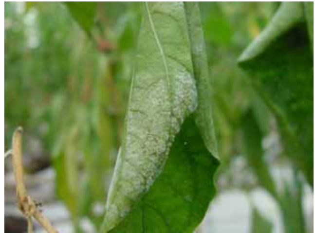
Figure 1. Unlike other powdery mildew diseases, greenhouse pepper powdery mildew, Leveillula taurica , forms on the under side of leaves not on the upper leaf surface.

Pepper powdery mildew is different in several ways from the mildews that infect tomato ( Erysiphe , Oidium lycopersicum ), or cucumber, ( Erysiphe cichoracearum , Sphaerotheca fuliginea ). Pepper powdery mildew grows unseen, within the leaf tissue for a latency period of up to 21 days. Unlike tomato and cucumber powdery mildew which is easily seen on the top side of the leaves, pepper powdery mildew grows on the under side of leaves (Figure 1).