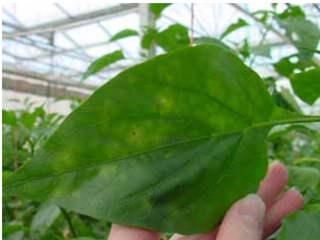
Figure 2. Light yellow spots may also form on the top side of the leaf corresponding to the powdery mildew colonies on the under surface of infected pepper leaves.

In general, pepper crops become more susceptible to this powdery mildew as they mature. Older plants and lower leaves are the first to show evidence of powdery mildew infection. Pepper powdery mildew needs living host plant tissue to grow and survive. The fungus only infects the leaves not the fruit or stems of pepper plants. Check for pepper powdery mildew by closely inspecting the underside of older leaves for the first signs of the disease. Look for fluffy, white patches of powdery mildew on the underside of leaves (Figure 1). These patches may turn brown rather than remaining white. The top surface of the leaf may appear normal or have diffuse, yellow patches which correspond to the mildew colonies on the lower surface (Figure 2). Early powdery mildew infections can be seen more easily by holding the leaf up to the light and looking for developing mildew colonies. Severely infected leaves wither and drop off causing plants to die. Dutch research showed that the amount of leaf drop depended not only on the severity of powdery mildew but also on the pepper variety. Outbreaks of pepper powdery mildew can devastate a pepper crop. Ontario greenhouse pepper growers have also experienced severe leaf drop resulting in sun burned fruit.