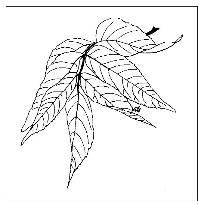
Figure 3. Foliage of Mexican-Buckeye.