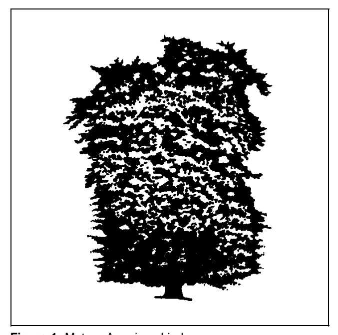
Figure 1. Mature American Linden.