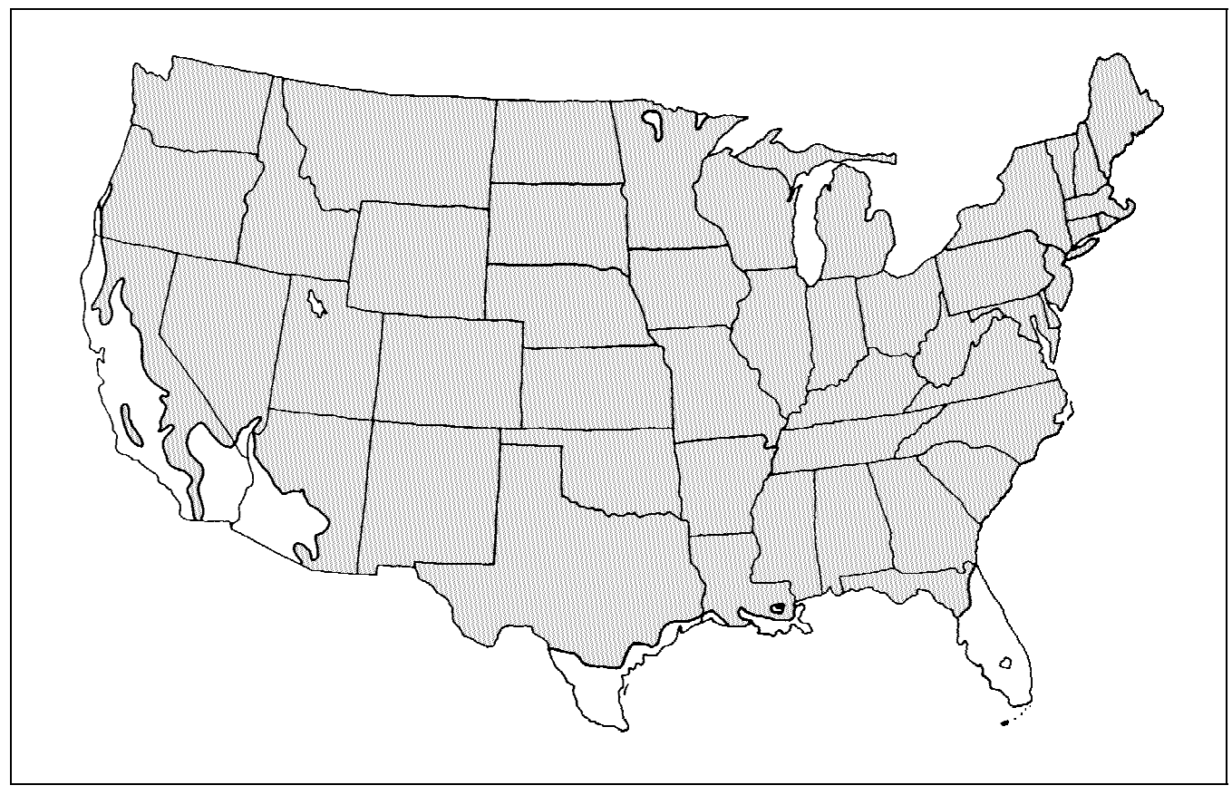
Figure 2. Shaded area represents potential planting range.