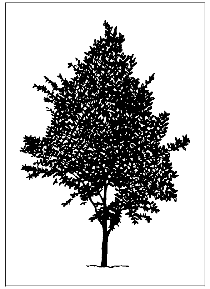
Figure 1. Young Japanese Stewartia.

Scientific name: Stewartia pseudocamellia Pronunciation: stoo-AR-tee-uh soo-doe-kuh-MEEL-ee-uh Common name(s): Japanese Stewartia Family: Theaceae USDA hardiness zones: 5B through 7 (Fig. 2) Origin: not native to North America Uses: container or above-ground planter; espalier; large parking lot islands (> 200 square feet in size); wide tree lawns (>6 feet wide); medium-sized parking lot islands (100-200 square feet in size); medium-sized