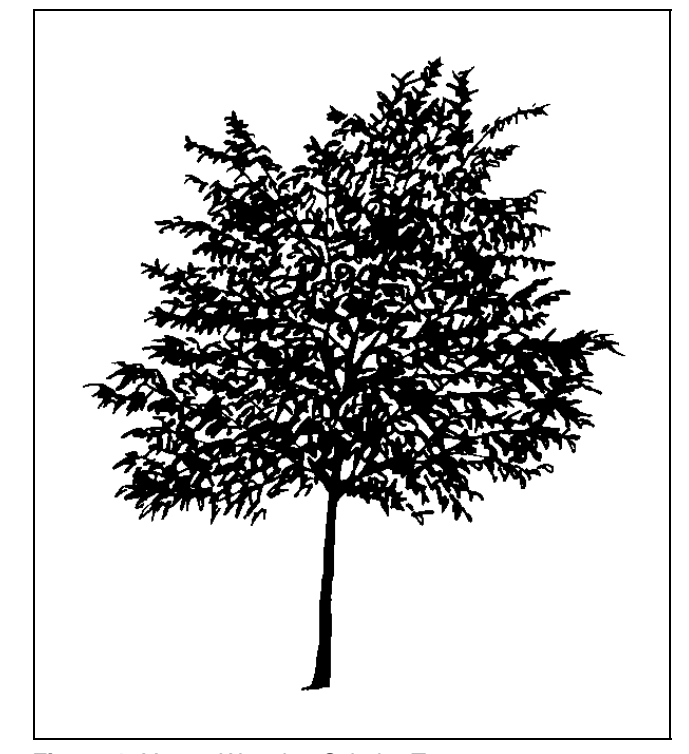
Figure 1. Young Weeping Scholar Tree.