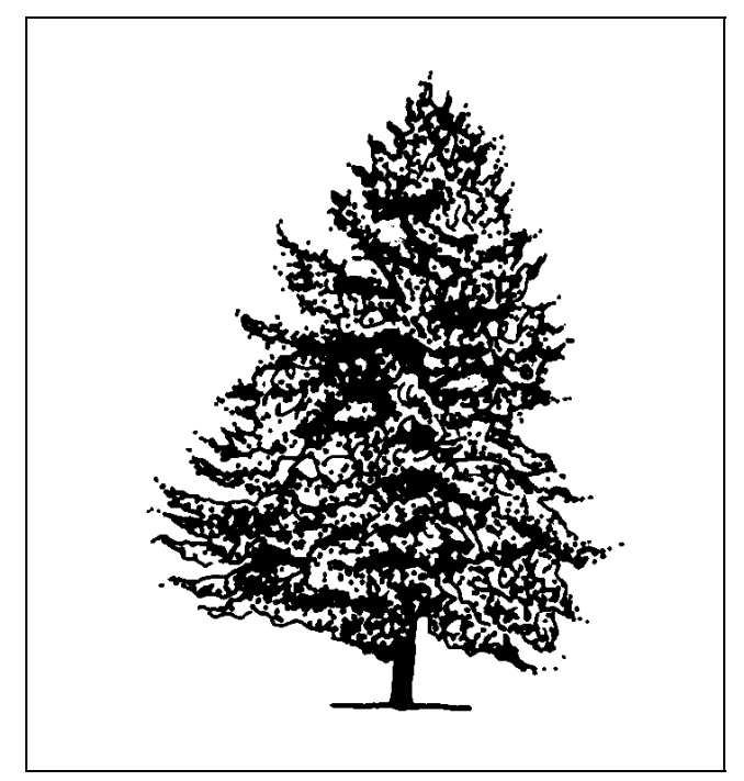
Figure 1. Young Pin Oak.

Scientific name: Quercus palustris Pronunciation: KWERK-us pal-US-triss Common name(s): Pin Oak Family: Fagaceae USDA hardiness zones: 4 through 8A (Fig. 2) Origin: native to North America Uses: large parking lot islands (> 200 square feet in size); wide tree lawns (>6 feet wide); medium-sized parking lot islands (100-200 square feet in size); medium-sized tree lawns (4-6 feet wide); recommended for buffer strips around parking lots or for median strip plantings in the highway; reclamation plant; screen; shade tree; specimen; sidewalk cutout (tree pit); residential street tree; tree has been successfully grown in urban areas where air pollution, poor drainage, compacted soil, and/or drought are common