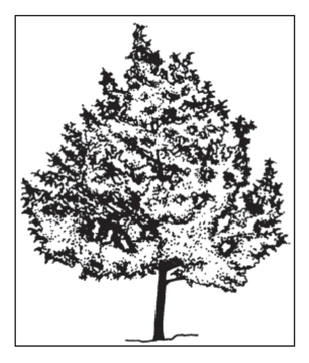
Figure 1. Middle-aged Scaret Oak.

Uses: large parking lot islands (> 200 square feet in size); wide tree lawns (>6 feet wide); recommended for buffer strips around parking lots or for median strip plantings in the highway; shade