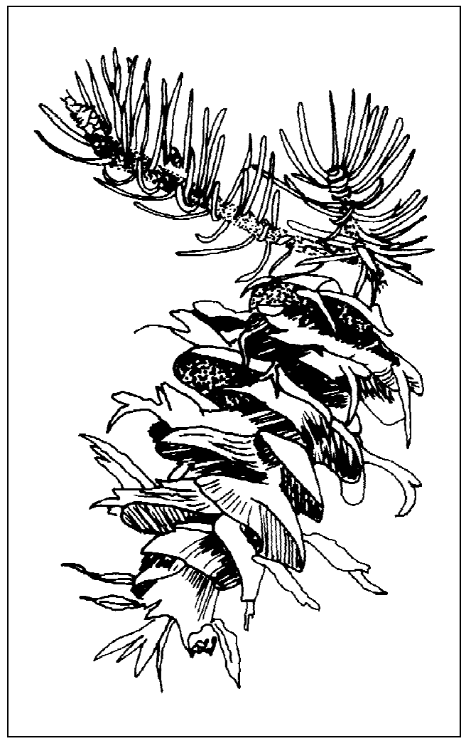
Figure 3. Foliage of Rocky Mountain Douglas-Fir.