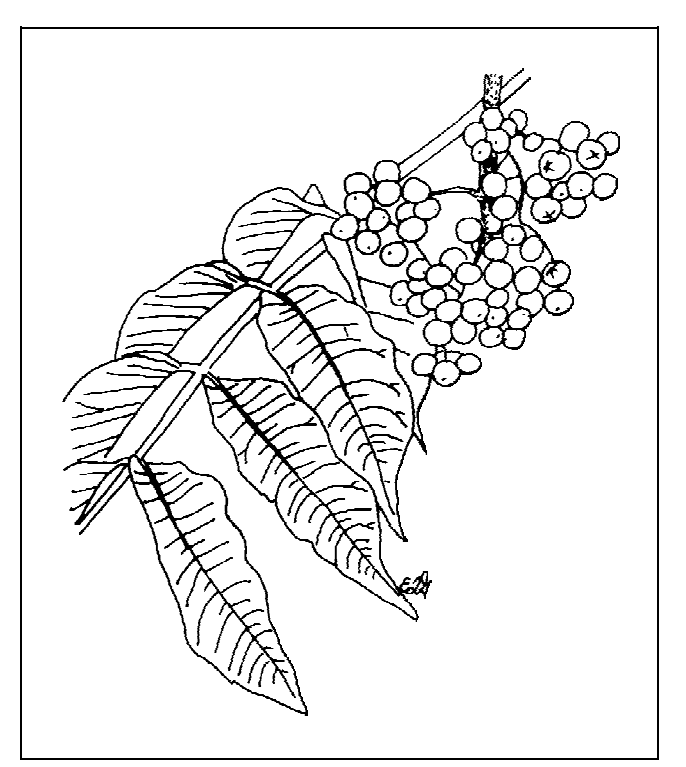
Figure 3. Foliage of Amur Corktree.