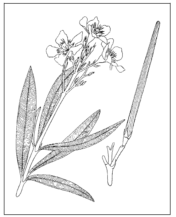
Figure 3. Flower of 'Variegata' Oleander.