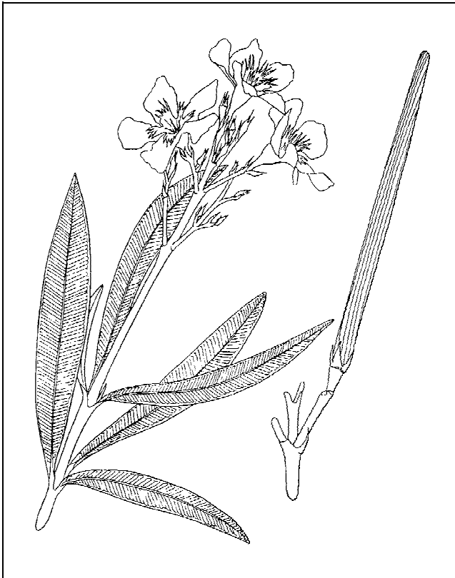
Figure 3. Flower of 'Isle of Capri' Oleander.