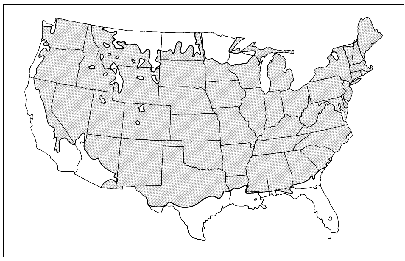
Figure 2. Shaded area represents potential planting range.