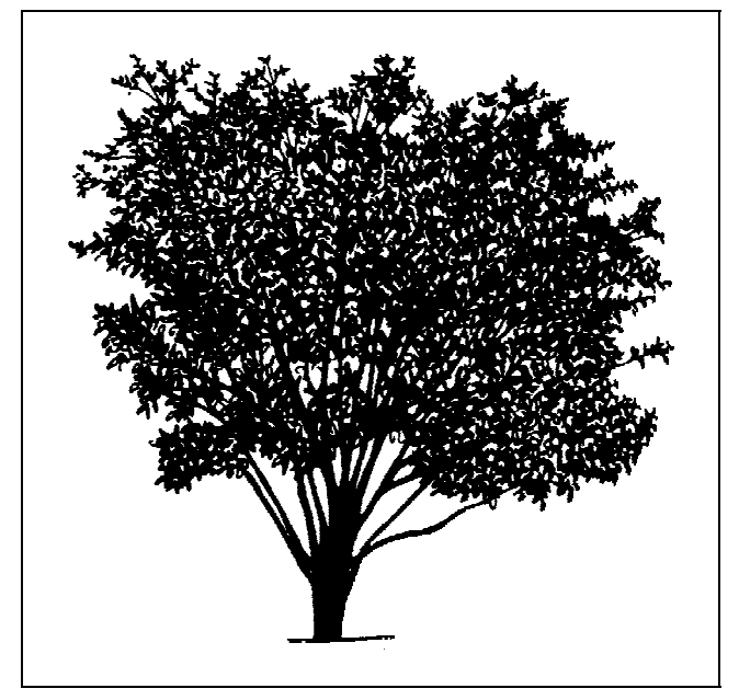
Figure 1. Middle-aged Amur Maackia.

Uses: container or above-ground planter; large parking lot islands (> 200 square feet in size); wide tree lawns (>6 feet wide); medium-sized parking lot islands (100-200 square feet in size); medium-sized tree lawns (4-6 feet wide); recommended for buffer strips around parking lots or for median strip plantings in the highway; near a deck or patio; shade tree; small