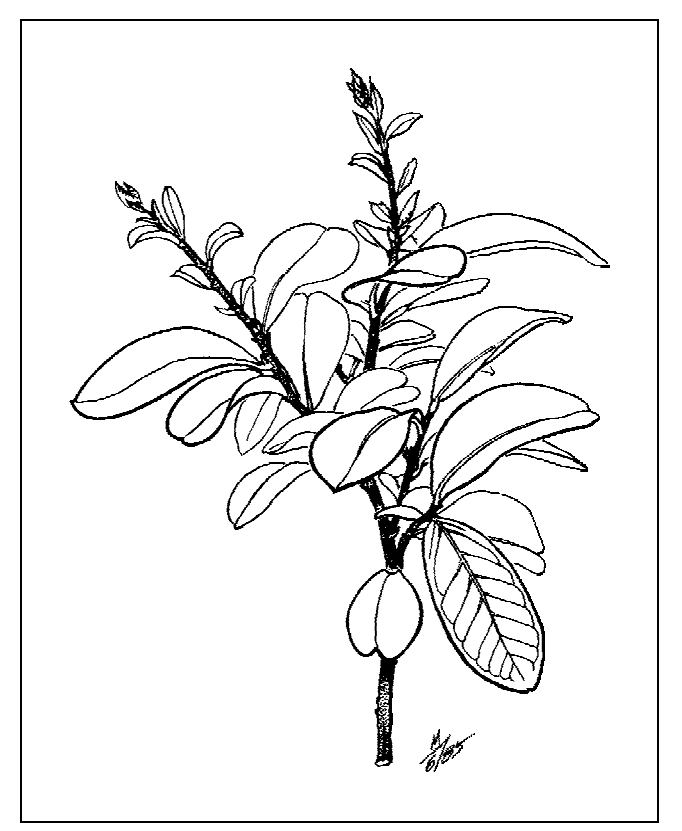
Figure 3. Foliage of 'Cherokee' Crapemyrtle.