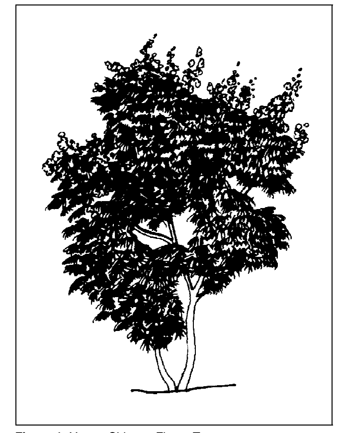
Figure 1. Young Chinese Flame-Tree.

USDA hardiness zones: 7 through 10A (Fig. 2)