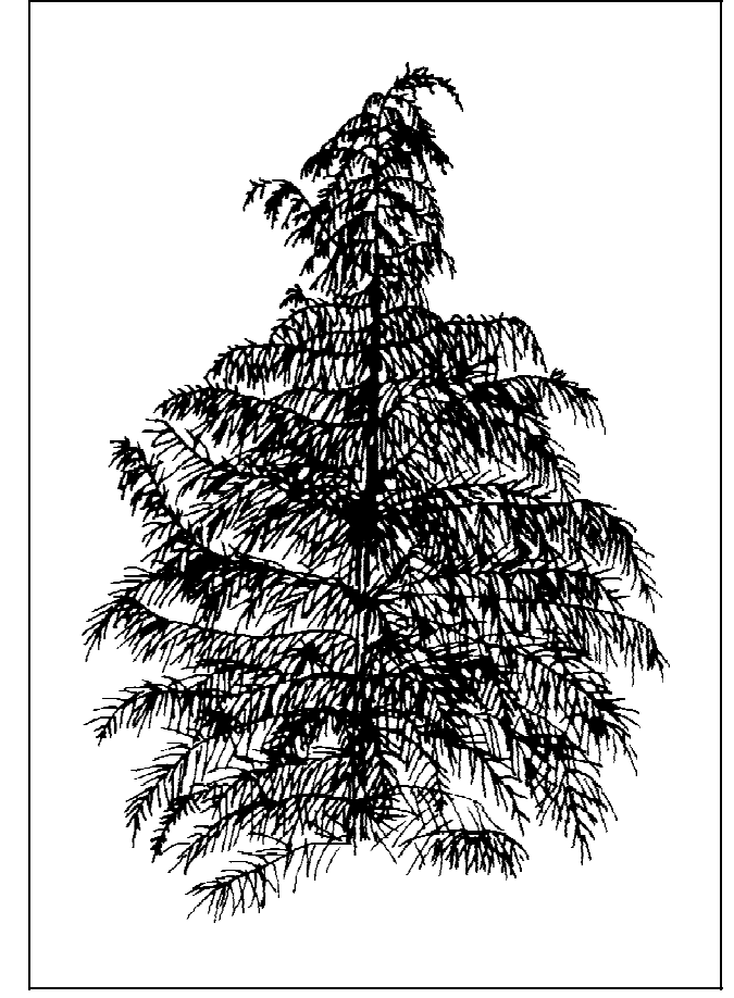
Figure 1. Young 'Pendula' Eastern Redcedar.